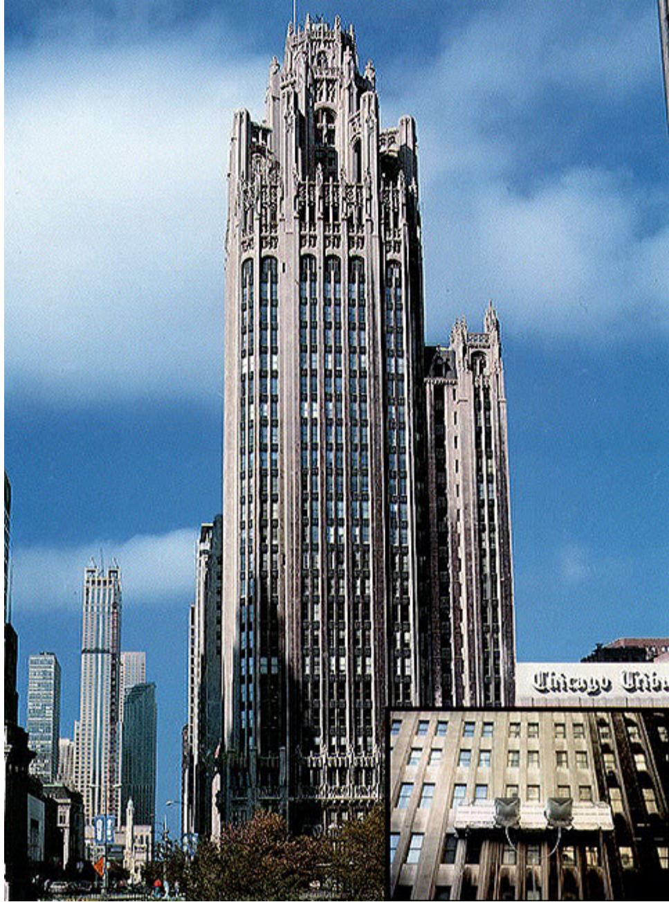
Chicago Tribune Tower