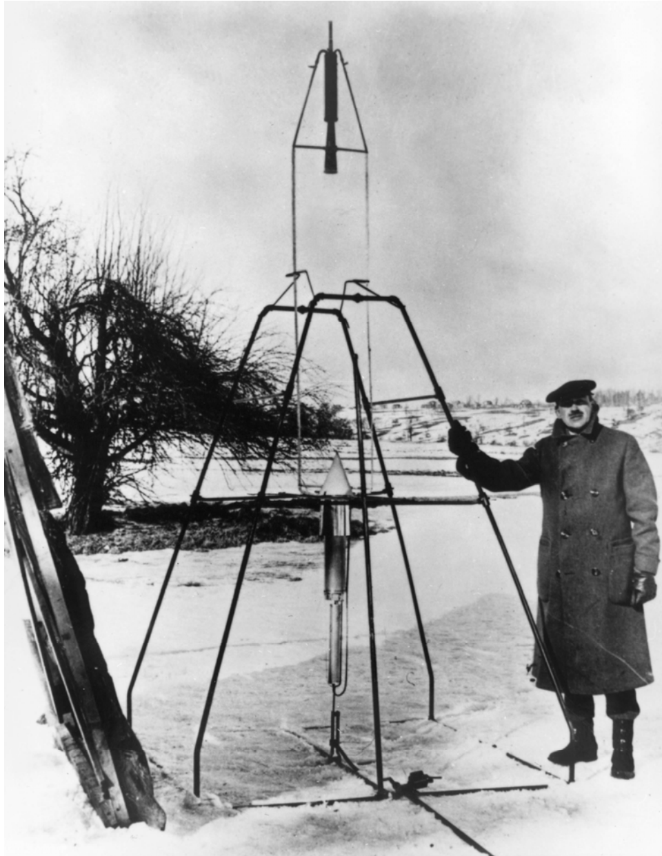
Liquid-Fueled Rocket (1926)

Robert Goddard's invention of the liquid-fueled rocket and methods of propulsion are still used by the North American Space Association today. His method of oxygen and liquid fuel propulsion only lifted the original rocket 184 ft. Now rockets have the ability to go into space thanks to the efforts of Robert Goddard.