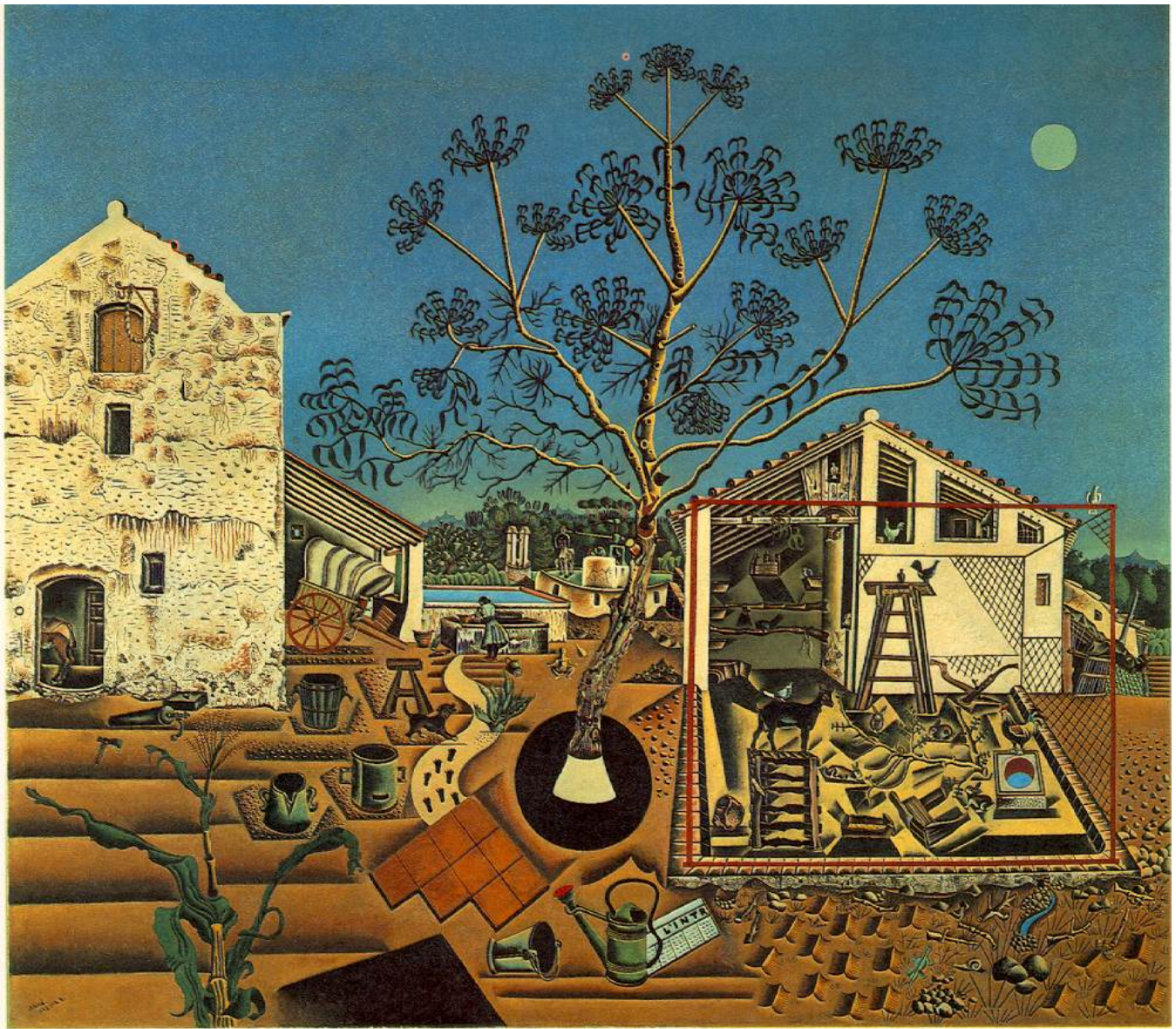
Joan Miró - La Masia (The Farm)