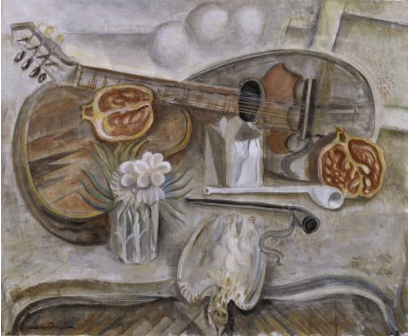
André Masson - Pedestal Table in the Studio