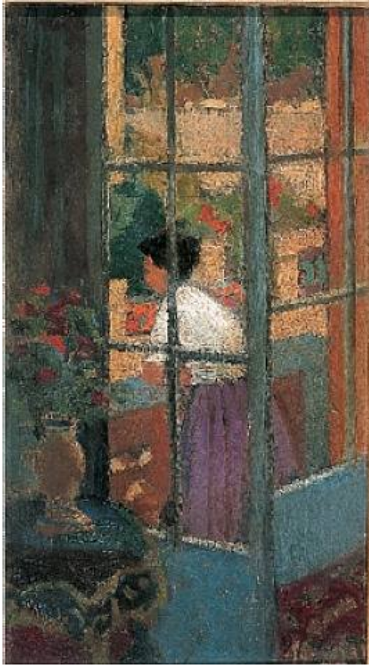
Dugald Sutherland MacColl - On the Terrace